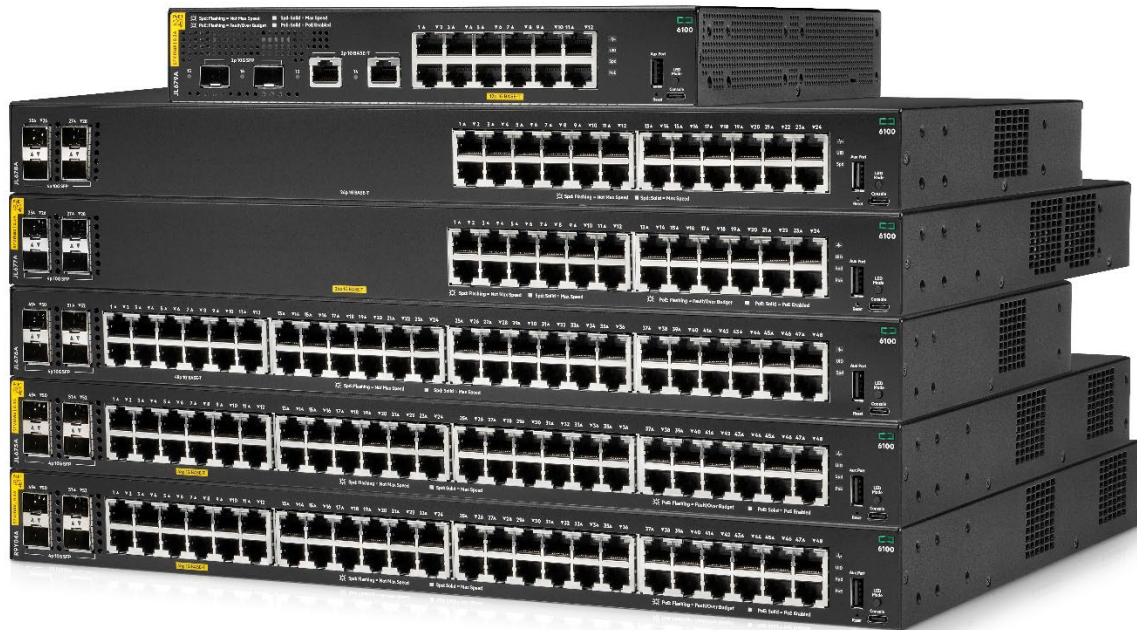
HPE Aruba Networking CX 6100 Switch Series

The HPE Aruba Networking CX 6100 Switch series supports management choices that include Web GUI, CLI, cloud-based and on-premises HPE Aruba Networking Central, so you can choose the best fit for your needs today with flexibility to change without replacing hardware. With enhanced access security, traffic prioritization, and IPv6 support, the HPE Aruba Networking CX 6100 Switch series also simplifies ownership and brings peace of mind with switch software embedded with no subscription required to enable and a Limited Lifetime Warranty.